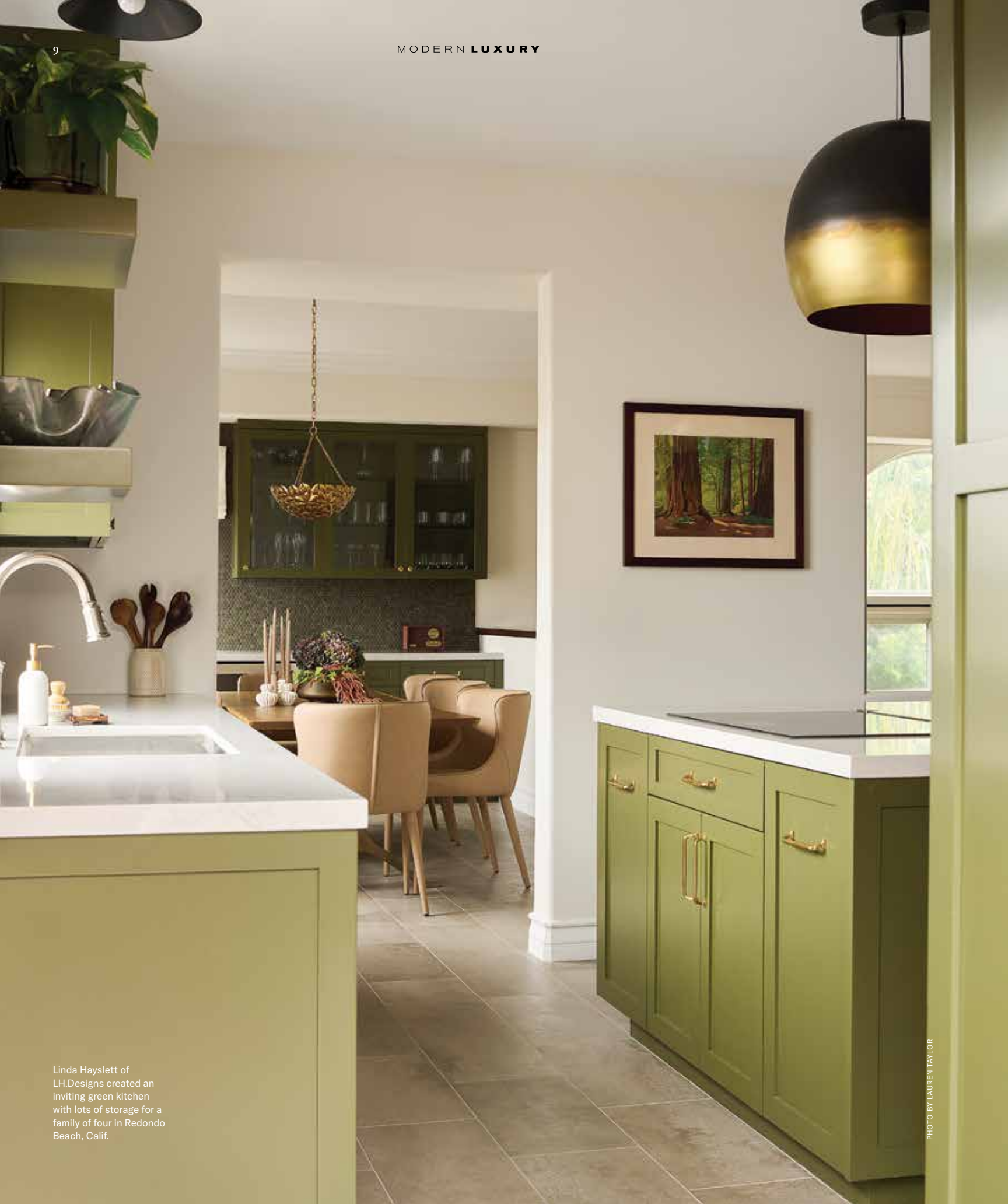
Linda Hayslett of L.H.Designs created an inviting green kitchen with lots of storage for a family of four in Redondo Beach, Calif.