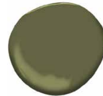
Benjamin Moore paint in Bonsai, benjaminmoore.com