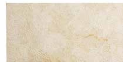
Zia Tile 12-by-24-inch bush hammered limestone tile in Buff, ziatile.com