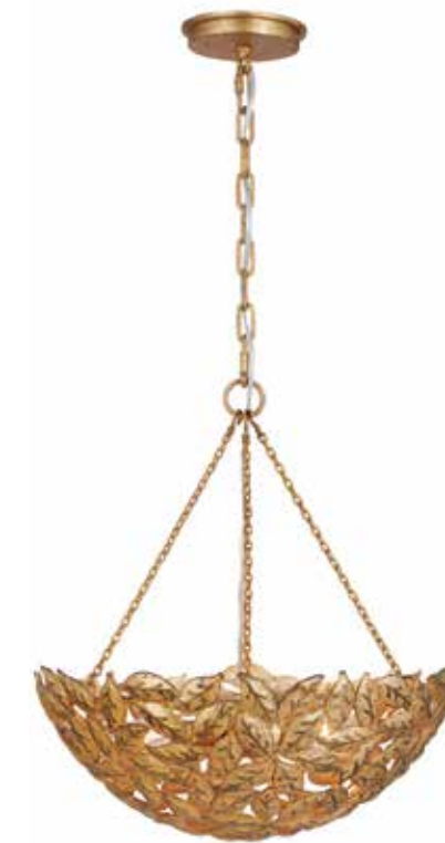
Alexa Hampton Kelan small pendant, visualcomfort.com