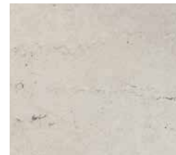
Silestone Earthic Raw in Raw A, cosentino.com