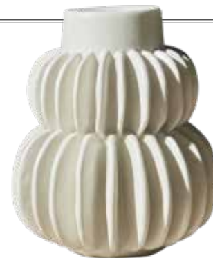
Lulu and Georgia Delilah vase in white, luluandgeorgia.com