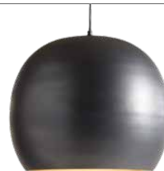
Crate & Barrel Elara black circular metal pendant light, crateandbarrel.com